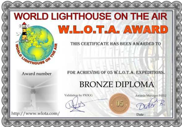
For 5 WLOTA Different Activated